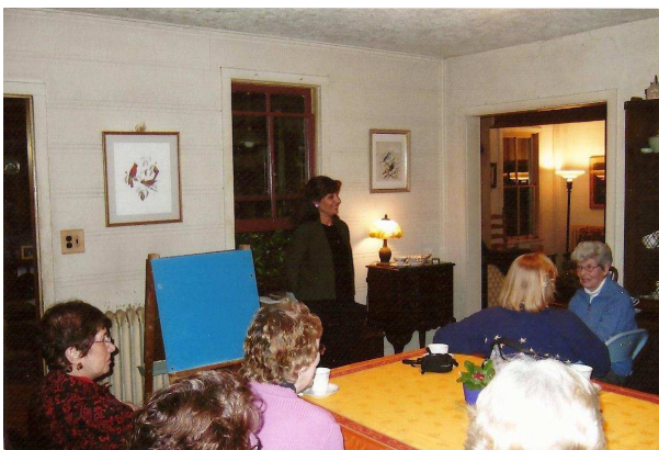
Here are some photos from our January meeting.